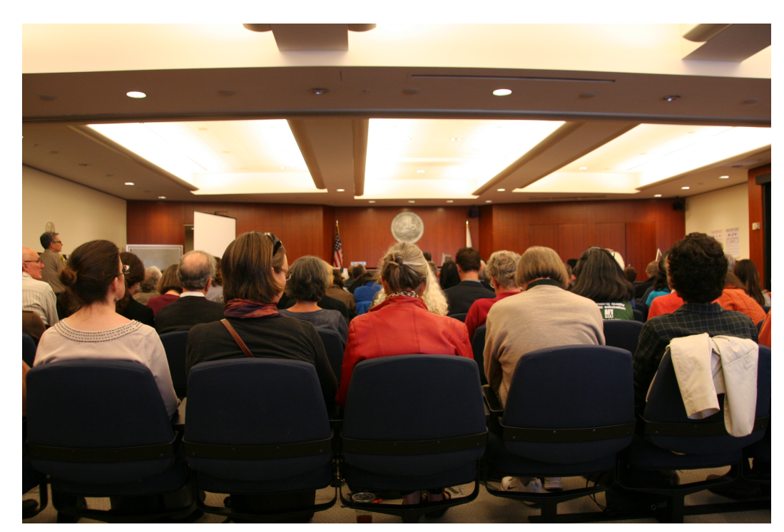
Day One Day Two Day Three Day Four Day Five Closing Arguments Day One of "The People vs. ACCJC",